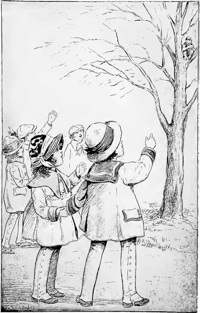
THERE WAS WANGO PERCHED HIGH ON A BIG TREE. Bunny Brown and His Sister Sue Giving a Show.